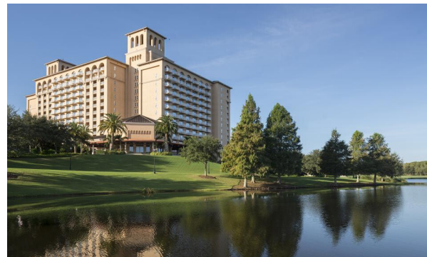
THE BEAUTIFUL RITZ-CARLTON GRANDE LAKES IN ORLANDO, FL. WILL BE THE SITE OF THE 8TH ANNUAL FLORIDA STROKE REGISTRY STAKEHOLDER MEETING IN AUGUST