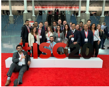
THE UNIVERSITY OF MIAMI DEPARTMENT OF NEUROLOGY TEAM AT ISC 2020