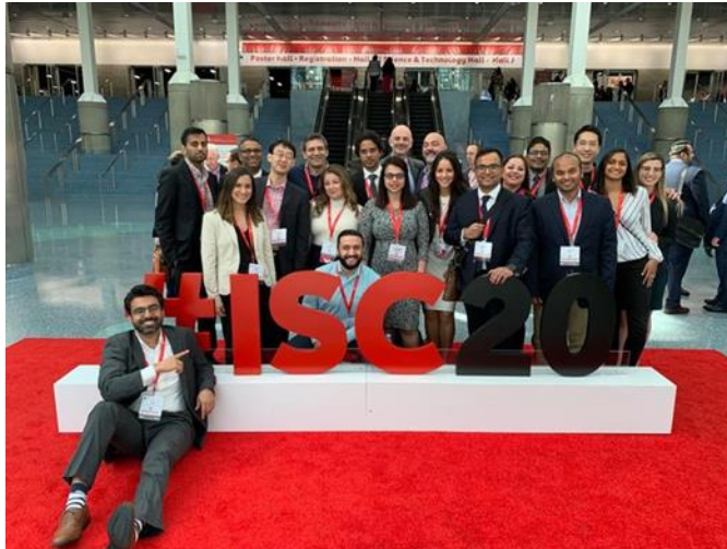
Members of the Department of Neurology at the University of Miami Miller School of Medicine at ISC20.