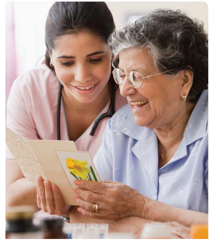
Hiring a home health aide is a great way to give yourself a break from the rigors of being the primary caregiver.

Finding caregiver training locally can be hit or miss. A good place to start is with your local Area Agency on Aging. Visit eldercare.gov to find an office near you.