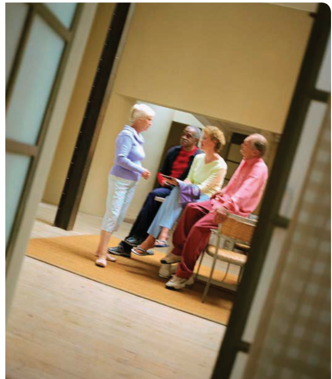
Connecting with friends or joining a stroke support group may help you cope with your changing emotions.