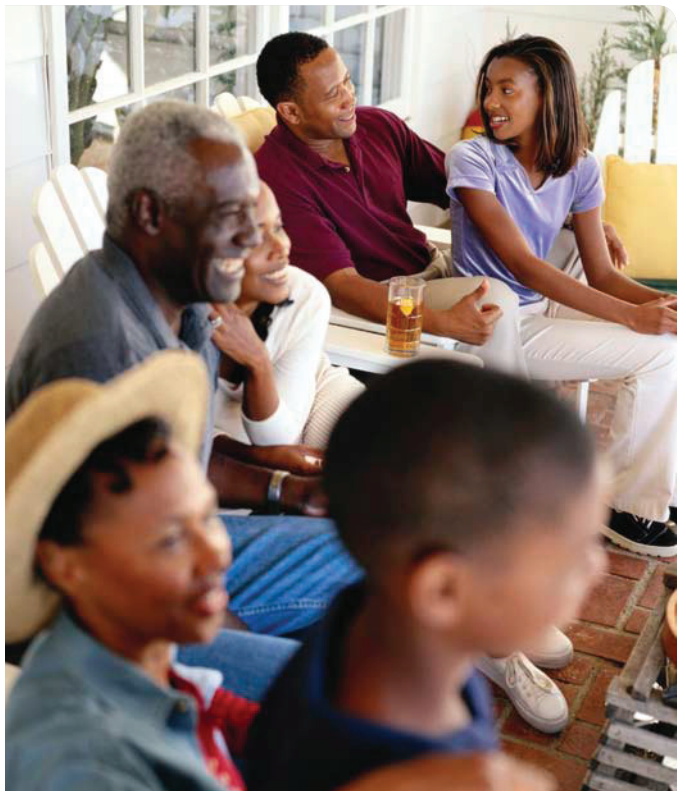
Being with family and friends may provide that energy boost you need.